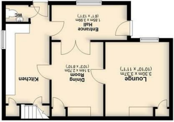
Total area: approx. 133.5 sq. metres (1436.9 sq. feet)

Approx. 99.8 sq. metres (1075.2 sq. feet)